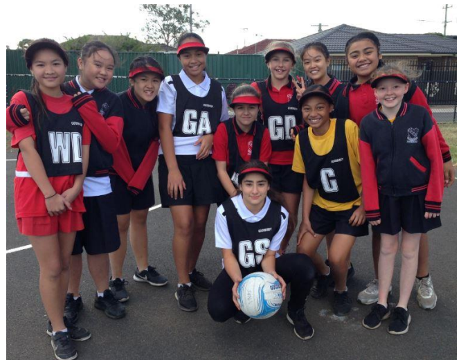
Winners are grinners! Congratulations, we are so proud of you!